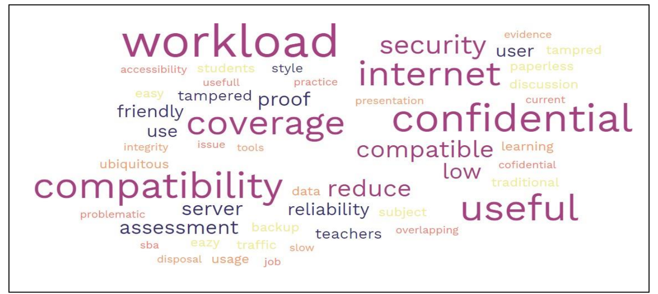
Figure 2: Form Six Teachers BCPPAS Sentiment Word Cloud.

Based on the data from Table 1, the scores suggest that the sentiment expressed in the text is largely neutral, with an average neutral score of 0.53. However, there is also a moderate amount of positive sentiment present, with an average positive score of 0.79. The average negative score of 0.18 indicates that there is also some negative sentiment present, although it is not as prominent as the neutral or positive sentiment. The total average score of 0.46 indicates that the sentiment in the text is slightly positive overall, but not strongly so. This suggests that the teachers' feelings are a mix of sentiments and might be somewhat ambiguous in terms of their overall sentiment. The results suggest that the teachers' sentiment is largely neutral, with a moderate amount of positive sentiment and some negative sentiment present as well. The overall sentiment is slightly positive but not strongly so. It is important to note that sentiment analysis is not always perfect and can be influenced by various factors, such as the specific language used and the context in which it is used (Harfoushi et al., 2018). Therefore, these results should be interpreted with some caution and in the context of the specific text being analyzed.