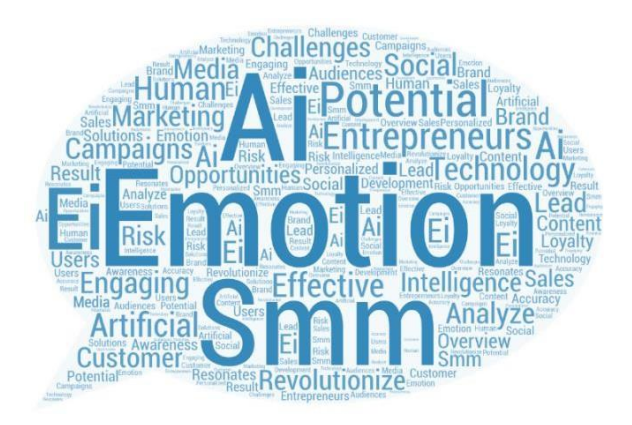
Figure 1: Word Cloud

The potential impact is on the way that entrepreneurs use social media marketing. By integrating EI and AI, entrepreneurs can create more personalized and engaging SMM campaigns that resonate with their target audiences. This can lead to increased brand awareness, improved customer loyalty, and increased sales.